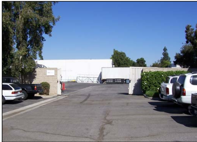
Main Yard Entrance