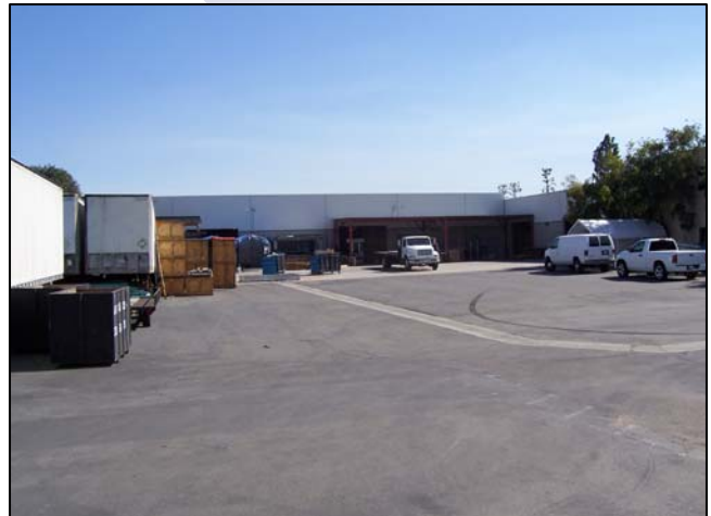
East Facing - Yard

For additional information, please contact: